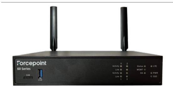
FlexEdge Secure SD-WAN 60L and 61 Appliances