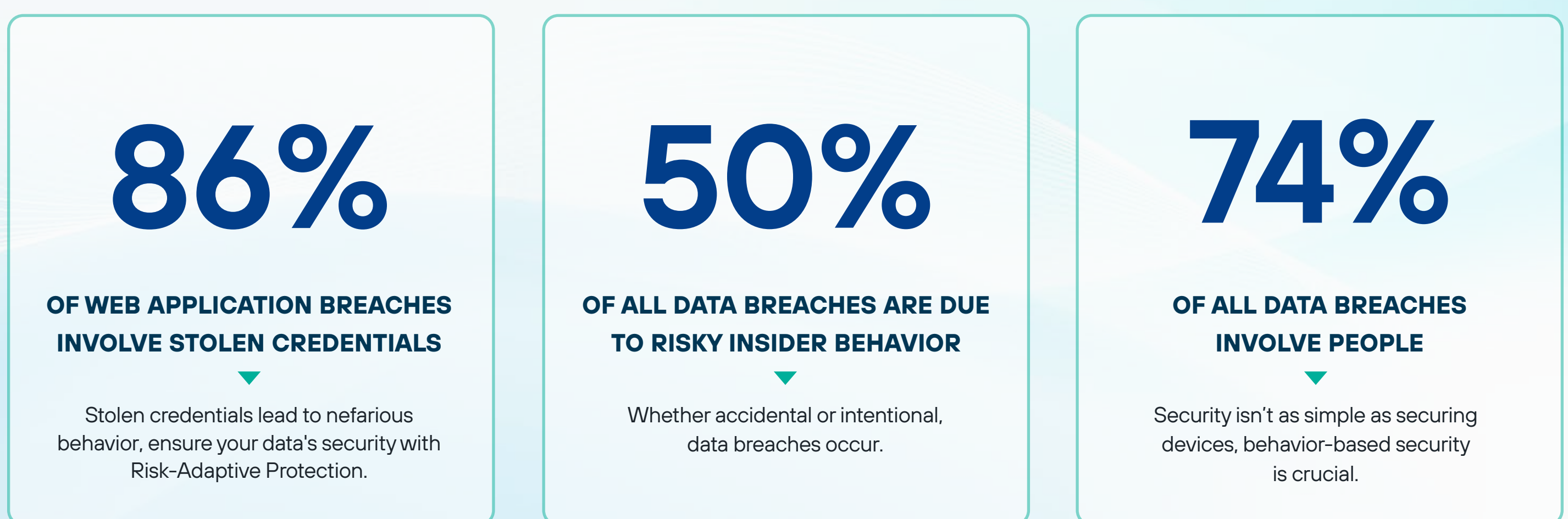
Citation: Verizon Data Breach Investigations Report, 2023

Human behavior causes data breaches, Risk-Adaptive Protection uses behavior-based security to reduce the risk. Be sure you're aware of insider threats so you can protect your organization.