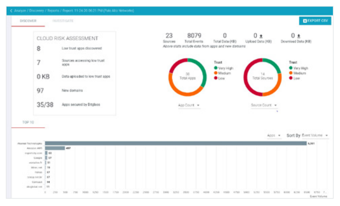
Figure 5: Shadow IT Discovery report.

The agentless reverse proxy mode supports shadow IT reporting. Shadow IT usage is collected from the log data from corporate firewalls and proxy servers, either by manual import or through a Forcepoint ONE syslog collector. Reports show application distribution by trust rating, as calculated by Forcepoint ONE, and top accessed applications with drill down to individual applications and individual source IP addresses, helping you understand your organizations, risk posture relative to web traffic. The Forcepoint ONE CASB can also let you control shadow IT traffic in forward proxy mode (see below).