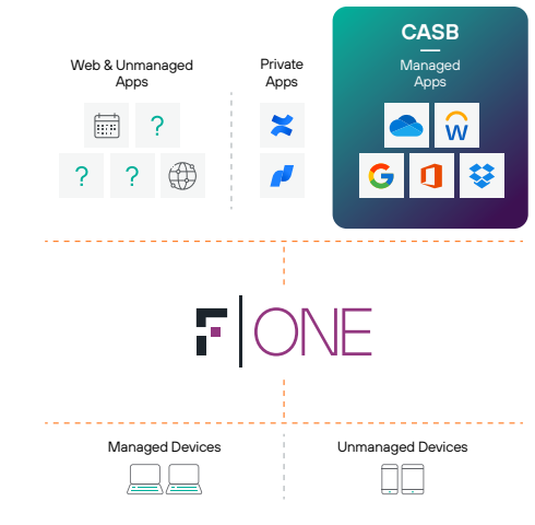
Secure data everywhere, for people working anywhere

Agentless reverse proxy mode enforces granular access with Forcepoint ONE integrated DLP and malware scanning from any device using a modern browser. It is ideal for monitoring and controlling access from BYOD and contractor devices. It leverages Forcepoint ONE's patented integration with any SAML 2.0 compliant IdP to redirect users to a Forcepoint ONE reverse proxy, where a complementary session with the SaaS application is established.